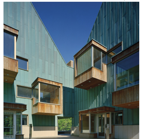
Bornhuetter Court, LTL