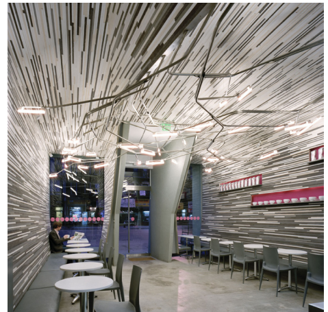
Fluff Bakery Interior, LTL